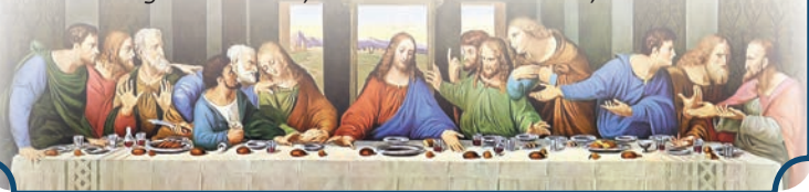
Concordia: The Lutheran Confessions, Large Catechism, Sacrament of the Altar, V.70ff

But those who are mindful of their weakness desire to be rid of it and long for help. They should regard and use the Sacrament just like a precious antidote against the poison that they have in them. Here in the Sacrament you are to receive from the lips of Christ forgiveness of sin. It contains and brings with it God's grace and the Spirit with all His gifts, protection, shelter, and power against death and the devil and all misfortune. So you have, from God, both the command and the promise of the Lord Jesus Christ. Besides this, from yourself, you have your own distress, which is around your neck. Because of your distress this command, invitation, and promise are given. This ought to move you. For Christ Himself says, "Those who are well have no need of a physician, but those who are sick" [Matthew 9:12]. In other words, He means those who are weary and heavy-laden with their sins, with the fear of death, temptations of the flesh, and of the devil. If, therefore, you are heavy laden and feel your weakness, then go joyfully to this Sacrament and receive refreshment, comfort, and strength [Matthew 11:28].